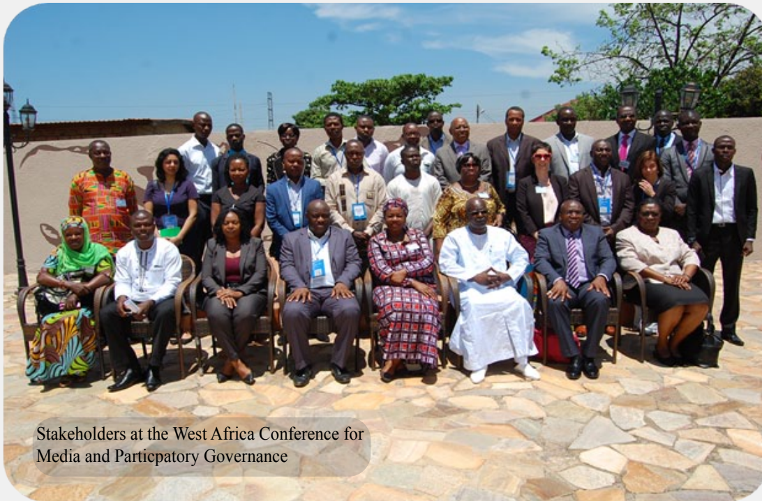
Stakeholders at the West Africa Conference for Media and Participatory Governance

On March 16 and 17, 2016, the Media Foundation for West Africa (MFWA) and national partners from 13 countries in West Africa met in Accra to strategise for more effective regional and national advocacy on safety of journalists, access to information and internet freedom at the National Partners Strategy and Capacity Building Meeting.