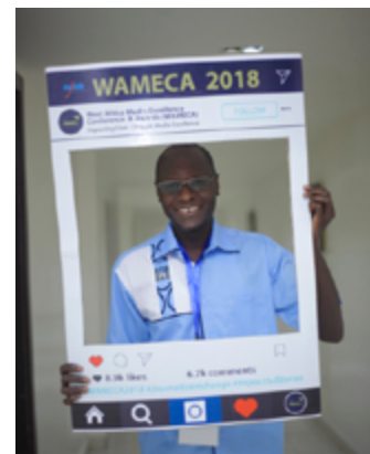
Samba Badji, Internationally acclaimed journalist from Senegal, supporting the publicity of WAMECA 2018