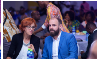
Guests at the awards