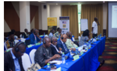
A cross-section of participants at the Conference