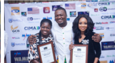
Award finalist with friends