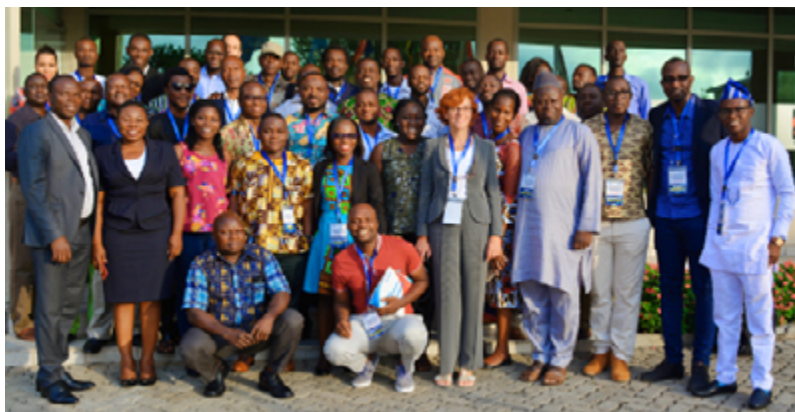
Group photo of Investigative Journalists and Facilitators across West Africa who were present for the Conference