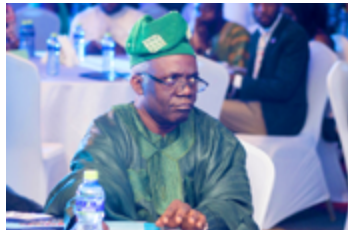
Mr. Femi Falana – Respected Lawyer and Human Rights Advocate in Nigeria