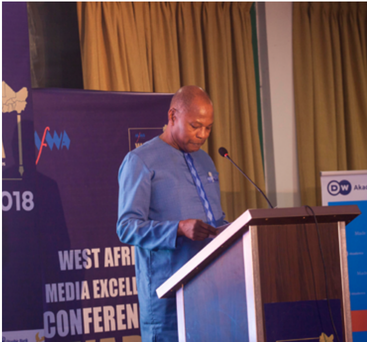
Guest of Honour, Dr. Mohamed Ibn Chambas, Special Representative of the UN Secretary-General and Head of UN Office for West Africa and the Sabel (UNOWAS), delivering a statement