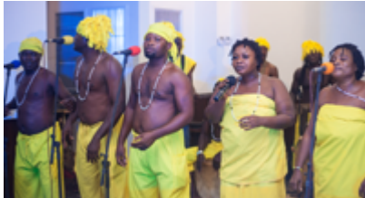
The Sensational Wulomei Band entertaining the audience with traditional music