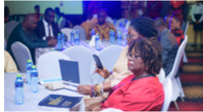
Cross-section of Guests at the Awards