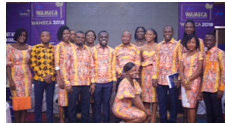
The MFWA Team behind WAMECA 2018