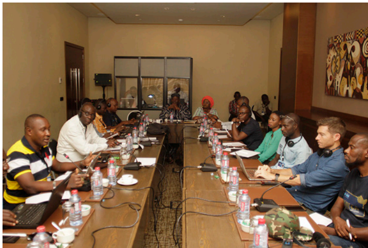
Partners at the meeting

The National Partners Strategy session came off in the morning of Saturday, October 28, 2017. The objective was to enhance the capacity of MFWA and national partners in developing a common strategy for effective regional advocacy on the internet and free expression in West Africa and on countering Impunity.