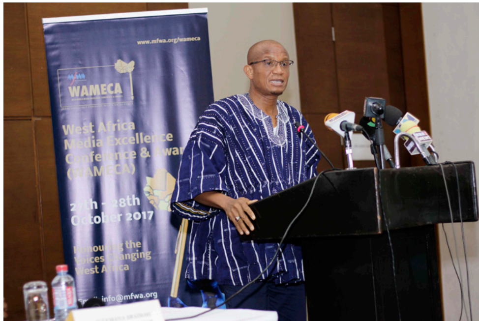
Hon. Mustapha Abdul - Hamid, Minister for Information, Ghana, giving the keynote address

He pledged the NPP government's commitment to ensuring that the RTI bill is on the table for the next parliamentary sitting for it to be debated upon and possibly have it passed.