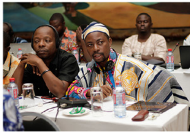
A conference participant asking a question