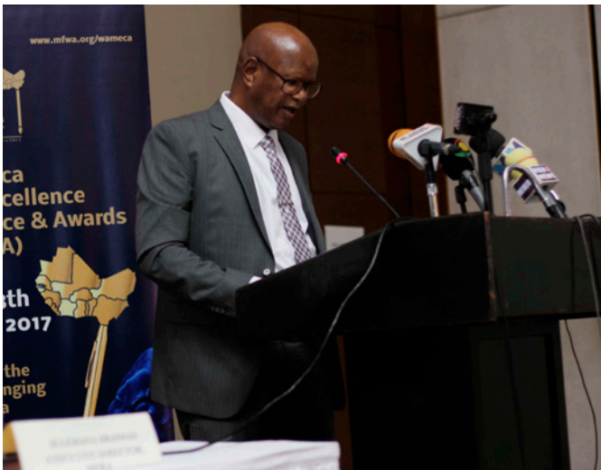
Hon. Demba Ali Jawo, Minister for Information and Communication Infrastructure - The Gambia

Mr. Quiroz added that journalists are builders of future prosperity of the nation "It all begins with you; with you telling the stories to the people; yes you can and America stands with you".