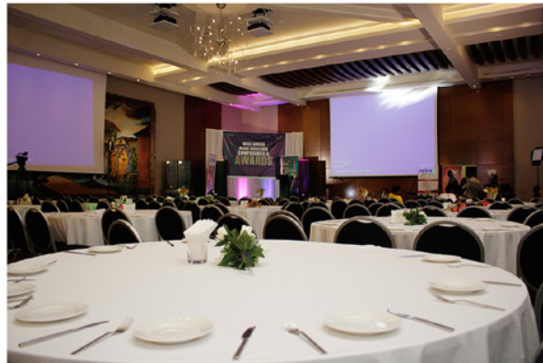
Set Up for WAMECA 2017 Awards Night