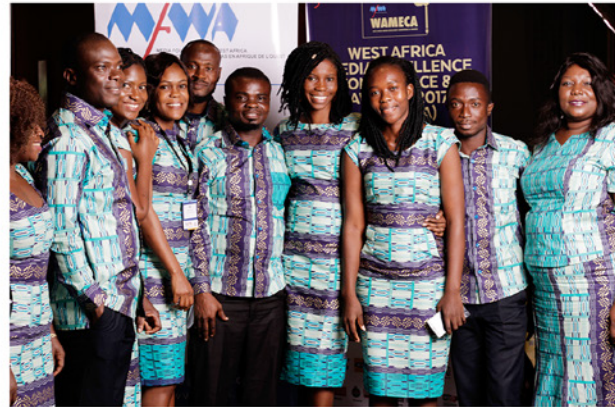
Staff of MFWA