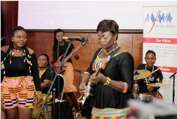
The Lipstic band in action