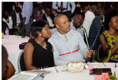
A cross section of Guests