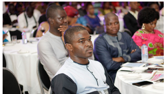
A cross section of guests