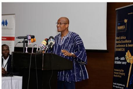
Hon. Mustapha Abdul - Hamid, Minister for Information, Ghana, opening the Conference