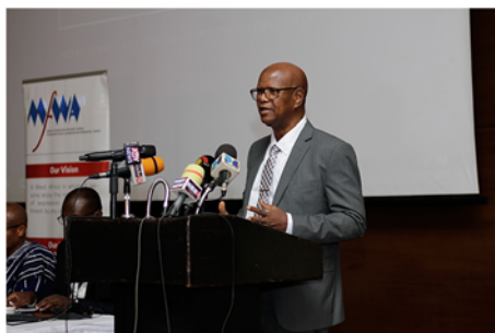
Hon. Demba Ali Jawo, Minister for Information and Communication Infrastructure, The Gambia, making a statement