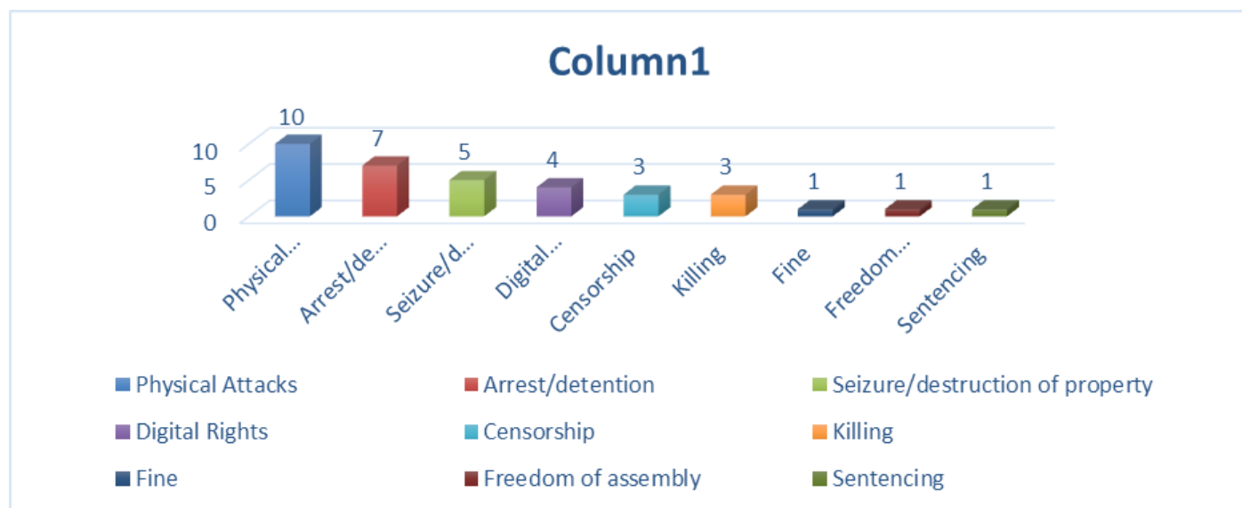
Figure 1: Types and Frequency of Violations

The quarter under review recorded 34 FOE violations which were made up of nine categories of violations. Physical attacks (9), arrests and detentions (8) and seizure and destruction of equipment (5) were the most frequent types of violations recorded. There were also two separate incidents of killings which resulted in three deaths. The other categories of violations are shown in Figure 1. The frequency of incidents of all the nine categories of violations is also presented in Figure 1 below: